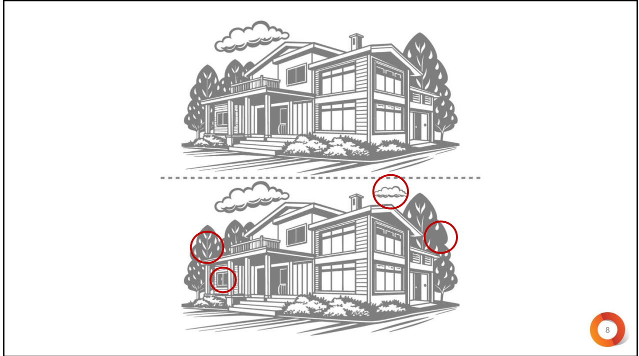
Image Comparison 3