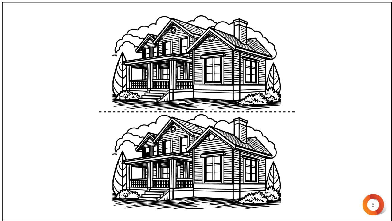
Image Comparison 2